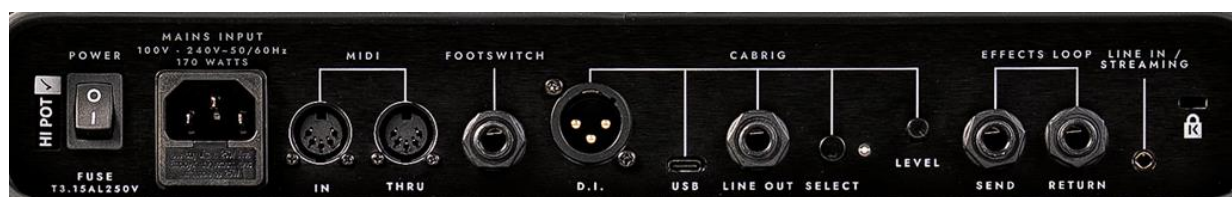
Blackstar IDX:100 - Rear Panel