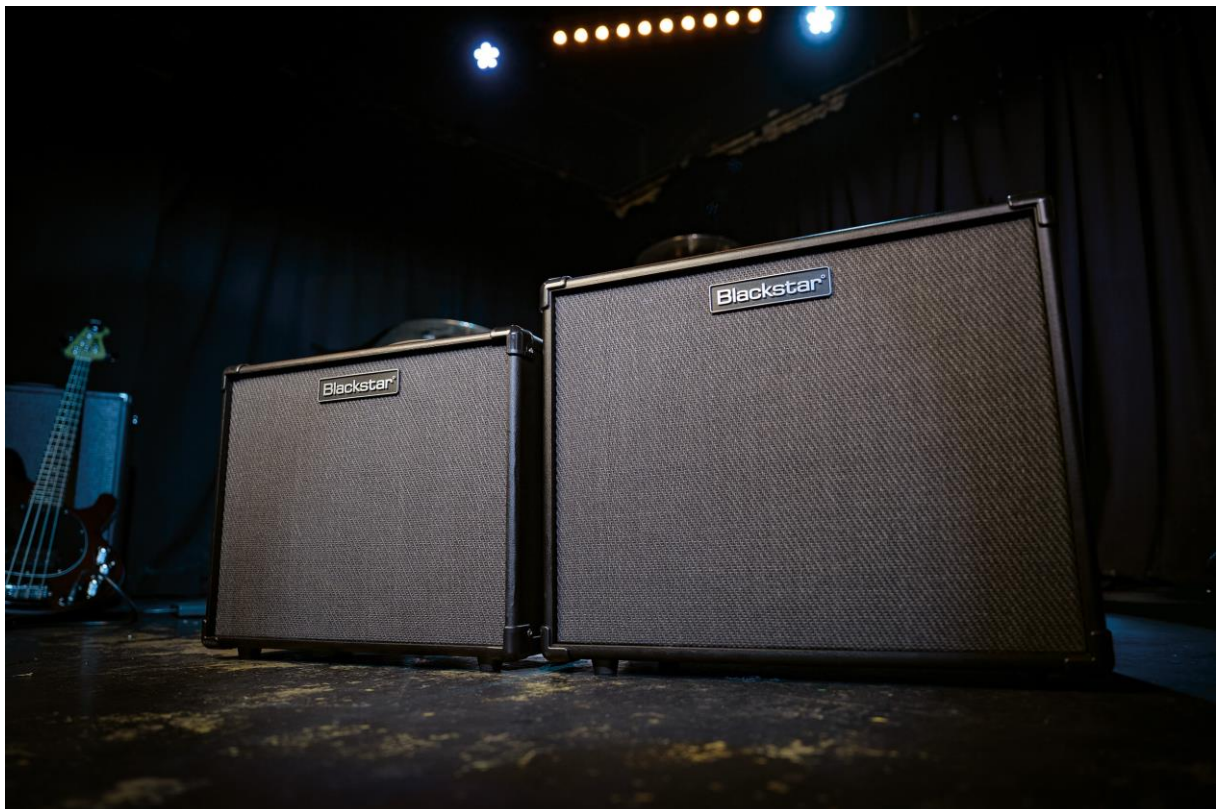
Blackstar IDX:50 Digital Combo (left) | Blackstar IDX:100 Digital Combo (right)

With foot-switchable controls, an intuitive 4-band EQ, selectable power modes (1W/20W/100W), and sleek modern design, the IDX:100 delivers premium sound, unmatched versatility, and effortless usability—all in one powerful amplifier.