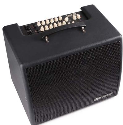
SONNET 120 Black