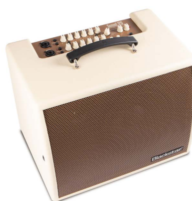
SONNET 120 Blonde